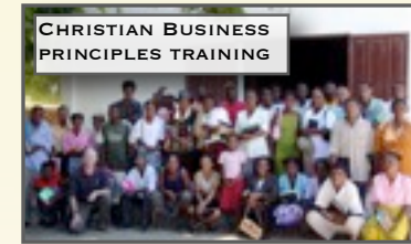
CHRISTIAN BUSINESS PRINCIPLES TRAINING

There are so many highlights to mention: