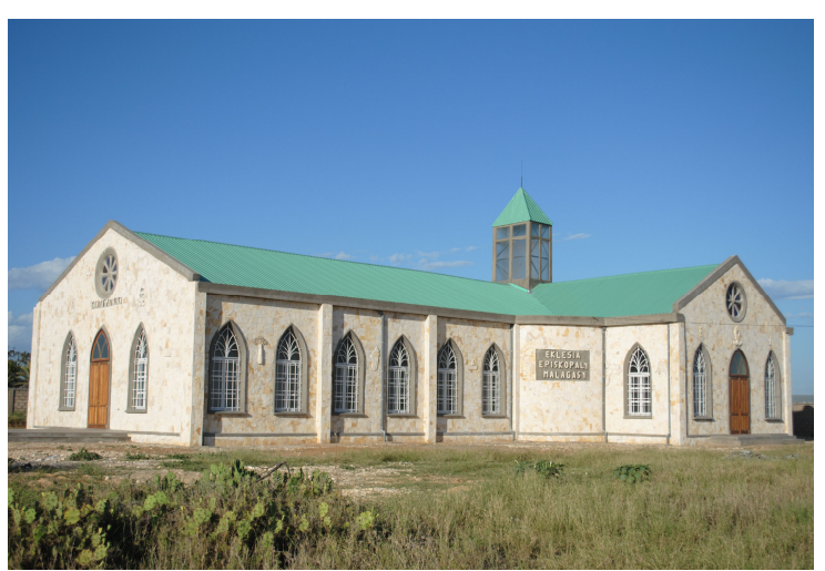
St Patrick's, Cathedral, Toliara

Worship at St Patrick's, Cathedral, Toliara.