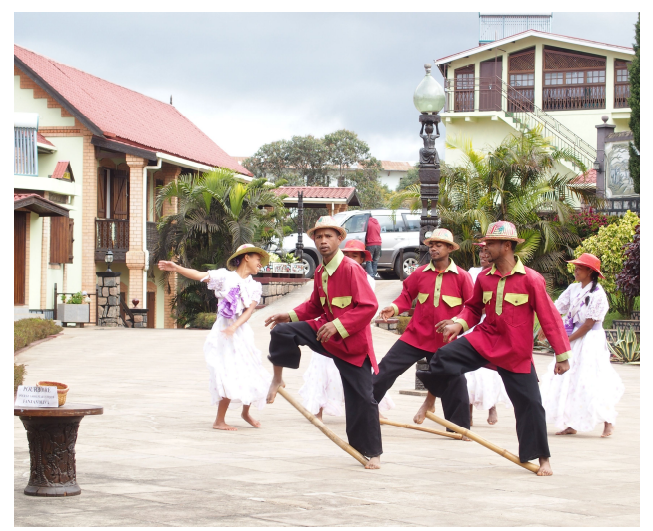
Dancers at Ambositra