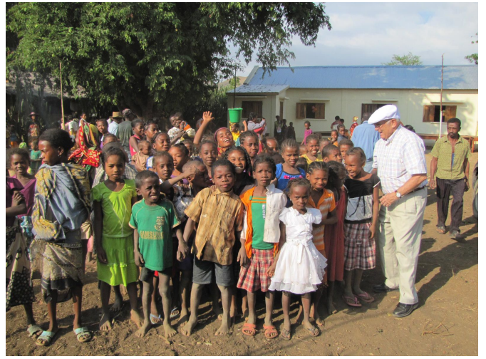
Children at Mahaboboka School