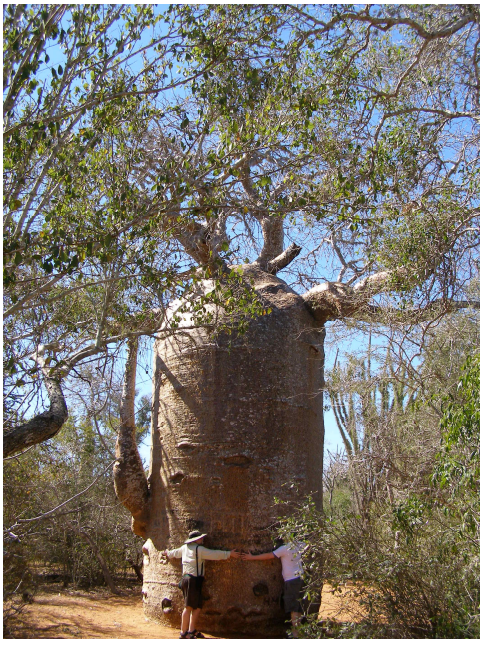
Baobab Tree, Reniala

After lunch we will visit Reniala spiny forest to see many plants and trees which originated in Madagascar, including a 1200 year old baobab tree.