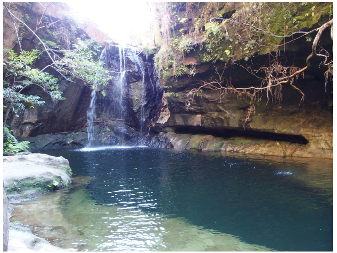
Isalo National Park