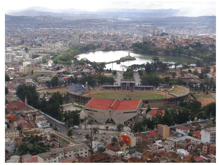
View of Antananarivo