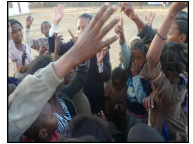
Yes to Jesus in Ambovombe

One of our student evangelists is currently there to continue with what the Lord is doing in the people of Ambovombe-Androy.