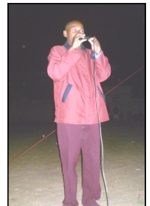
Ev. Crescend making an altar call after showing the Jesus Film