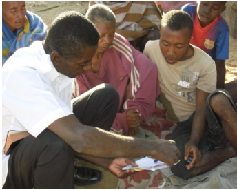
Person-person outreach in Mitsinjo

« Investing in the youth is a worthwhile investment... »