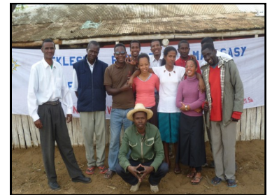
The mission team