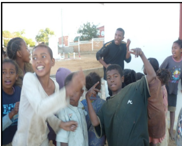
A little jig by the youth

« Investing in the youth is a worthwhile investment... »