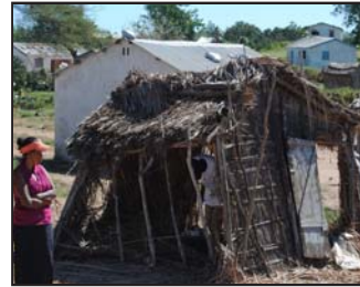
Hut destroyed by the cyclone