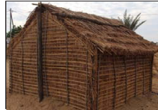
Your $100 donation built this new house where 8 people live