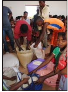
Cyclone relief: rice distribution