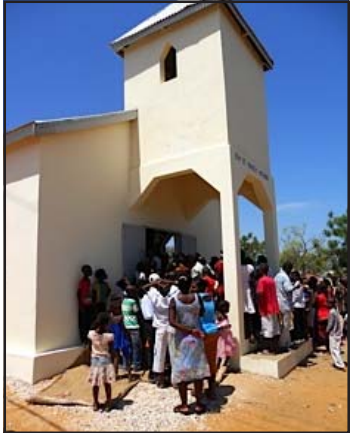
Dedication of St. Mikael's