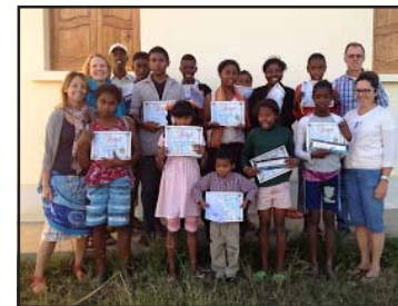
Students from the summer computer camp