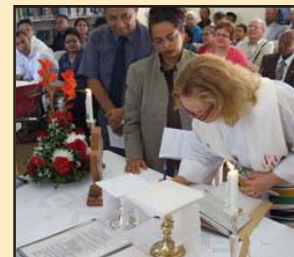
Signing the parish register