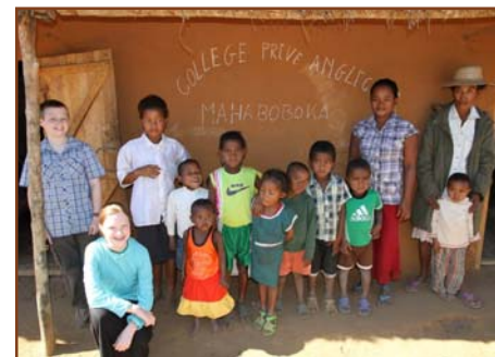
At the laying of the cornerstone