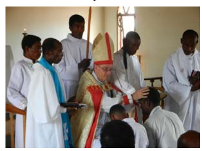
Dedication of the new dormitory