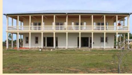
The Gathering Place

The two-story building contains multiple offices (including the Bishop's office) and a large meeting space – which can also be used temporarily as a chapel – on the lower floor. This level will serve as the "welcoming center" as people come to meet, worship, and socialize with the McGregors in an atmosphere of peace and joy.