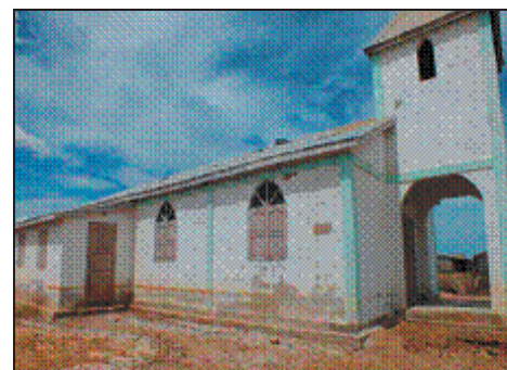
This church was severely damaged and has been repaired with your donated funds.

The diocese has distributed over 17,060 kilos of rice (in April and June distributions) for over 3,735 people living in 18 different communities in Sakaraha and Toliara parishes. We have also distributed 40+ boxes of used clothing. We have also repaired or built temporary housing for over 231 families. Funds will also be used to repair or replace some of the damaged church properties.